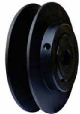
Variable pitch pulley

Additionally, the variable speed control comes with a programmable timer.