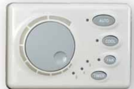
Variable speed control