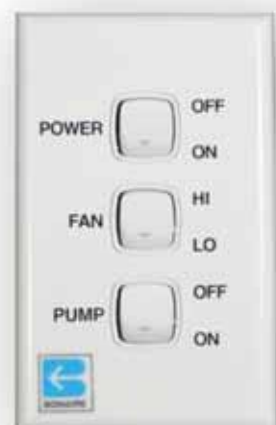
Two speed control