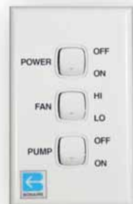
Two speed control

In the interest of continued product improvement, Bonaire reserves the right to alter specifications without notice. E. & O.E.